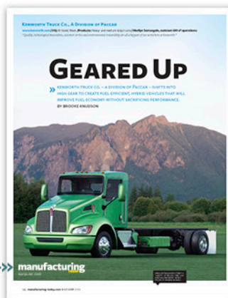
FRONT (page 1)