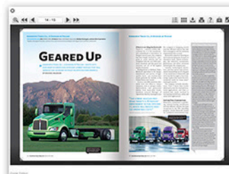
DIGITAL FLIP BOOK

Digital flip books can be placed on your website or emailed to new clients for unlimited use and take your message to the next level.