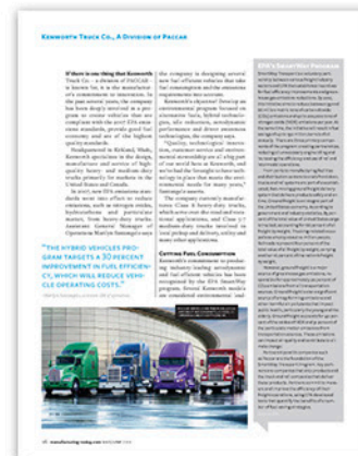
BACK (page 2)

Brochures are printed on high-quality paper and can be turned around in ten business days from the day you approve your brochure layout!